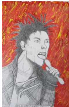
Sid Vicious